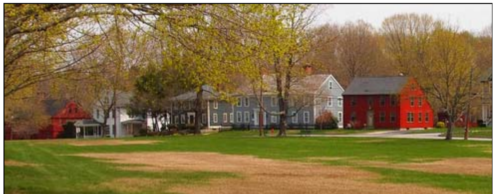
Historic Norwichtown Green