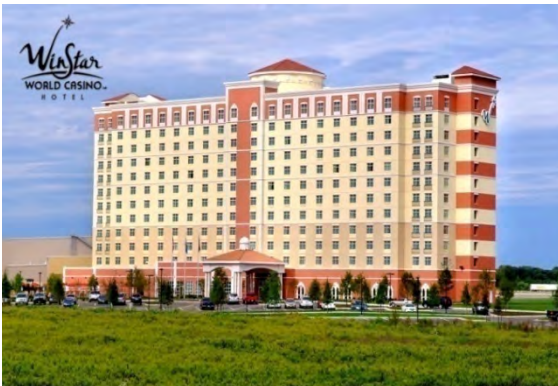
Above: Winstar World Casino Hotel – Thackerville, OK Managed by Winston Hospitality