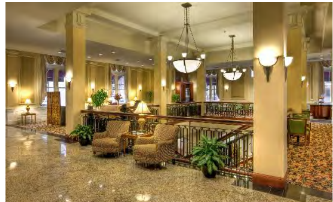
Above & Right: Hampton Inn & Suites Baltimore Inner Harbor Developed & Operated by Winston Hotels