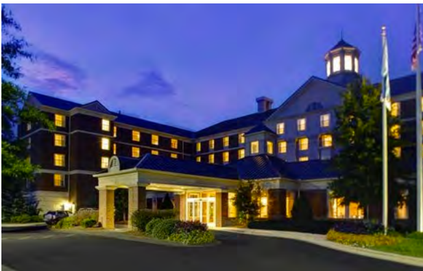
Above: Marriott Courtyard - Chapel Hill, NC Owned & Managed by Winston Hospitality