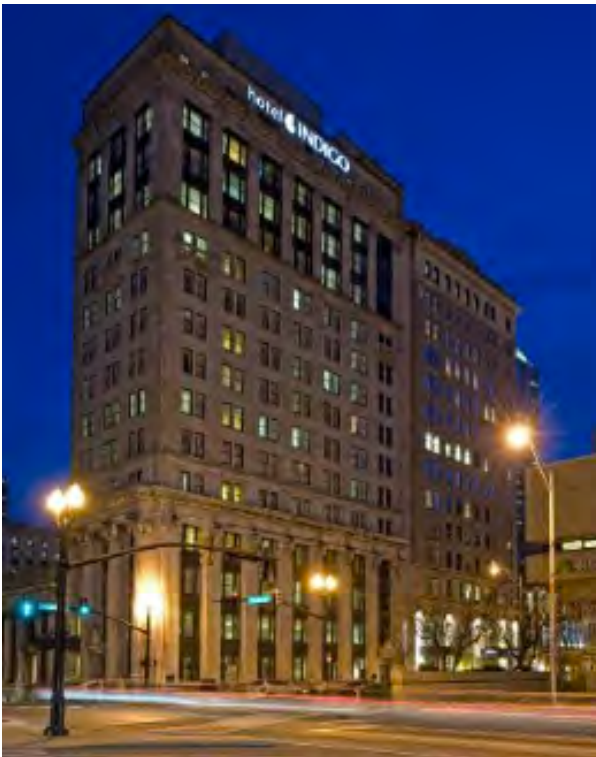
Above: Hotel Indigo – Nashville, TN Owned & Managed by Winston Hospitality