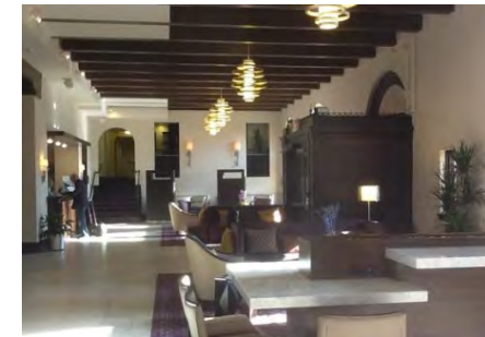
Above & Right: Courtyard Marriott Country Club Plaza – Kansas City, MO Developed & Operated by Winston Hotels