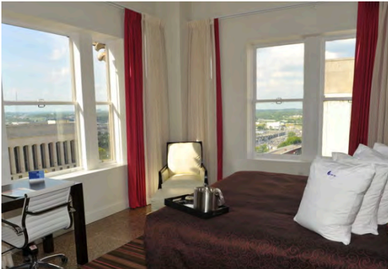
Above: Hotel Indigo – Nashville, TN Owned & Managed by Winston Hospitality