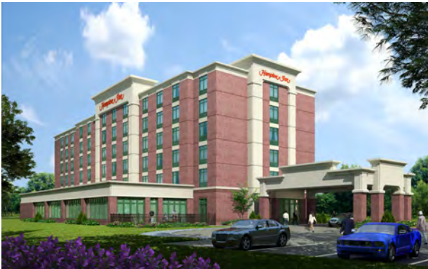
Above: Hampton Inn & Suites – Norwich, CT Owned, developed, and managed by Winston Hospitality, Inc.