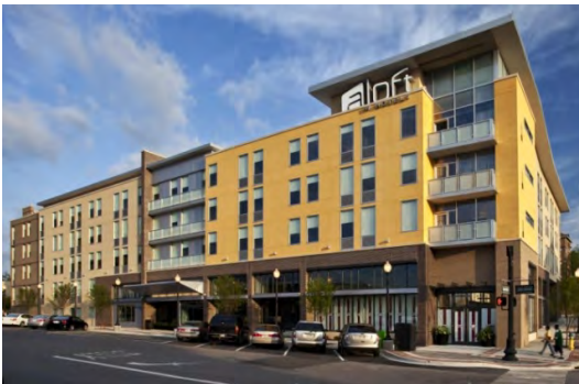
Above: Aloft Hotel – Homewood, AL Owned & Managed by Winston Hospitality